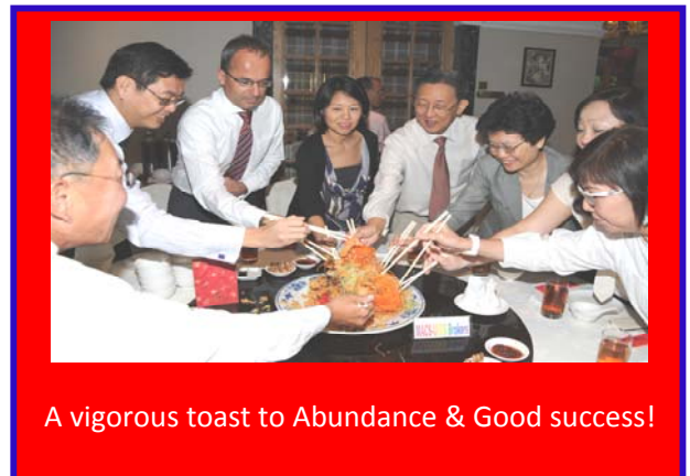
A vigorous toast to Abundance & Good success!