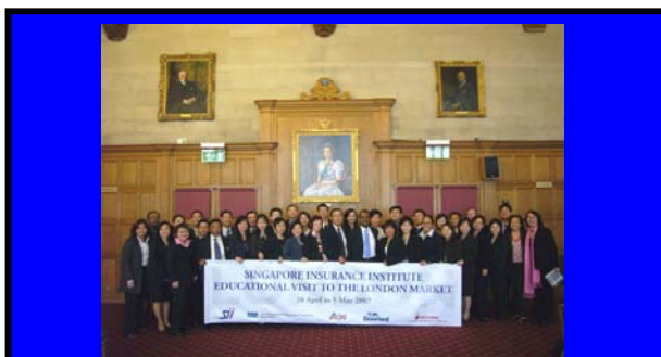
Delegates to Educational Visit to London in Year 2007